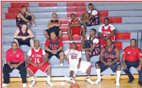
Mount Clemens High School Boys Varsity Basketball Team

To find up to date information on the Mount Clemens Community School District go to our new Facebook page, MOUNT CLEMENS BATTLING BATHERS . Media blasts including upcoming district-wide events, student, athletic, teacher, staff and parent news will be documented on our page. This new media tool will generate awareness of our district, help us connect with our families and build relationships within our community.